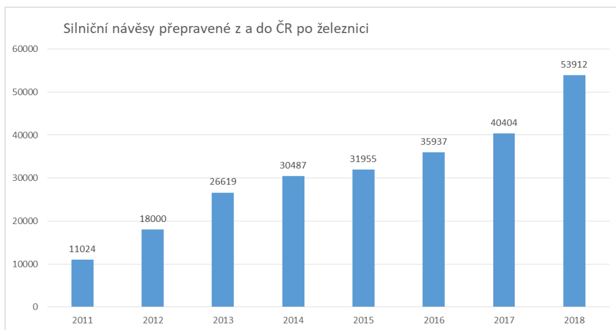
Fig.2 Road semi-trailers transported from and to the Czech Republic by rail

On the figure below, there is displayed the positive trend in goods transport by rail loaded in intermodal trailers: