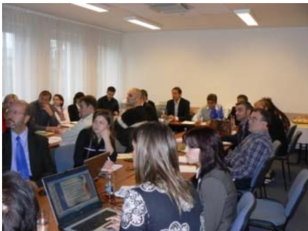
Picture 2- 4th SC & PR meeting in Prague, Populus Hotel, 22-23/10/2007

training of administrators. Furthermore, a thorough action plan on the implementation of the "Formulation of proposals & policy recommendations" accompanied with an executive summary, was also discussed and decided during the meeting.