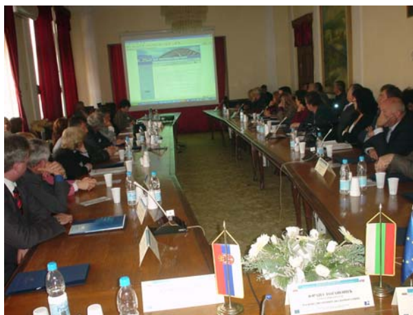
Picture 5- Presentation of EMBRACE II at Nish

One of the main factors for success of the future business centers is the networking and the permanent exchange of information and experience among the sixth Chambers. Using this opportunity, EMBRACE II team members from RCE Niš, presented also EMBRACE II project to the entrepreneurs and other interested participants.