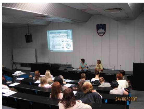
Picture 4- Regional conference organized by RDA of South Primorska

The Regional Development Agency of South Primorska, Slovenia , was mostly busy with the collection, analysis, and adaptation and processing of data related to local entrepreneurship and the economic development of the region, which will serve as the necessary data for the Pilot SMEs Observatory network. To further promote the EMBRACE II project RDA published in its monthly magazine, "Entrepreneurial voice of Primorska" , information about the progress of the project and implemented activities. It also carried out two additional regional conferences and the team also plans to implement at least one more in January.