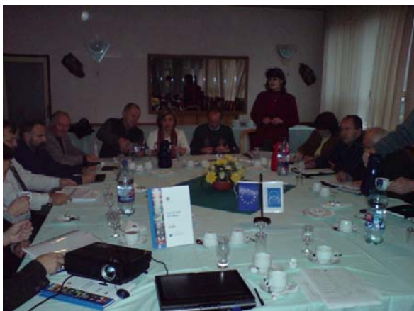
Picture 6- Rural meeting in Kosice

The local mayors who participated in the meetings attended the follow-up discussion on possible co-operation with the agency ASRD and local entrepreneurs, in future local development projects.